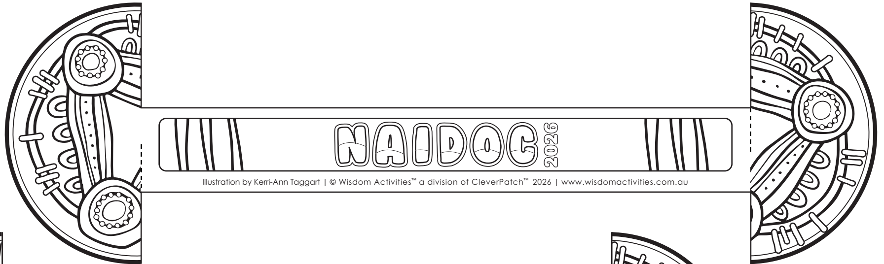
Illustration by Kerri-Ann Taggart | © Wisdom Activities™ a division of CleverPatch™ 2026 | www.wisdomactivities.com.au